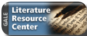
Literature Resource Center (LRC)

PrioInfo Pan-Nordic Consortium 2011 consists of the below databases from Gale Cengage Learning: