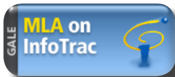
MLA International Bibliography (MLA)